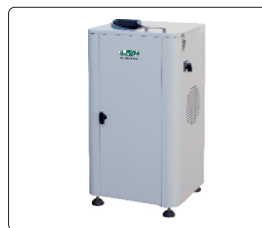
spectral sample grinder (optional)

*Including polarimeter, pressure reducing valve, electrode brush and other consumable and spare parts