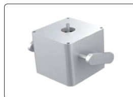
small sample fixture (optional)